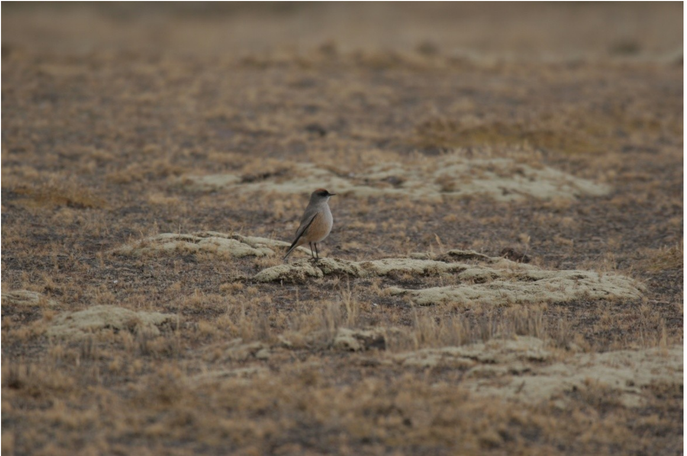
Figure 2. Muscisaxicola capistratus is shown in a short grass meadow where multiple individuals were present and observed exhibiting agonistic behavior (chasing). This behavior could represent non-breeding territoriality.

and the importance of continued exploration to the remote and complex regions of the Andes. It is likely that the range of most species mirrors the distribution of suitable habitat. With the exception of some species that may be at their physiological limits, most species characteristic of the puna may be limited elevationally only by the snowline.