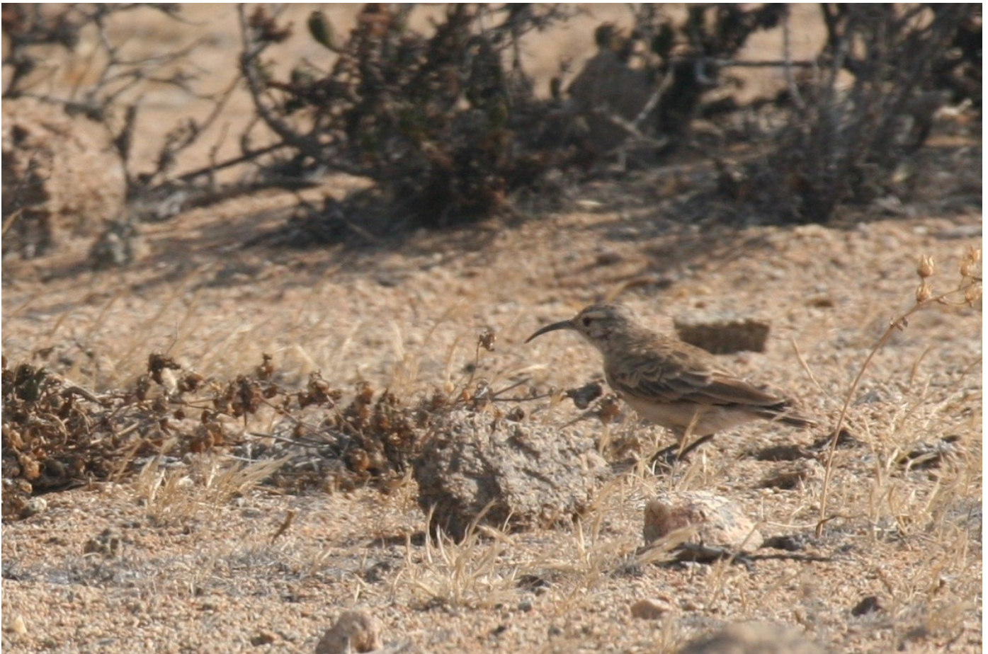
Figure 2. Geositta tenuirostris observed near the coast in dpto. Arequipa. This is the first coastal record to our knowledge.

Asthenes humilis (Streak-throated Canastero) - Schulenberg et al. (2007) and Fjeldså and Krabbe (1990) both excluded the southern Titicaca basin from its distribution. We collected one individual in dpto. Arequipa, 5 km S Chivay at 4590 m in July 2009. This is the first record of A. humilis in dpto. Arequipa. REG observed another individual at 4700 m elevation in W Puno dpto., 110 km NE of the Chivay location. These observations suggest a continuous distribution within the current disjunct range (Fig. 1D).