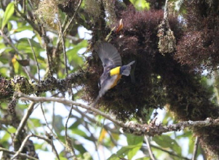
Figure 1. Image of a male Golden-rumped Euphonia (Euphonia cyanocephala) crossing the path of the female as she enters the nest (see <a href="https://hbw.com/ibc/1428531">hbw.com/ibc/1428531</a>). This behavior, which we termed a 'flyby', was seen 22% of the time both male and female arrived at the nest together. Flyby begins upper left and continues clockwise to bottom left.

composed almost entirely of moss and rootlets, lined inside with a mix of mostly Chusquea bamboo leaves and a few dark rootlets intermixed. Three eggs were recorded on 14 February and two nestlings were observed the following day. The third egg did not hatch and was presumed infertile.