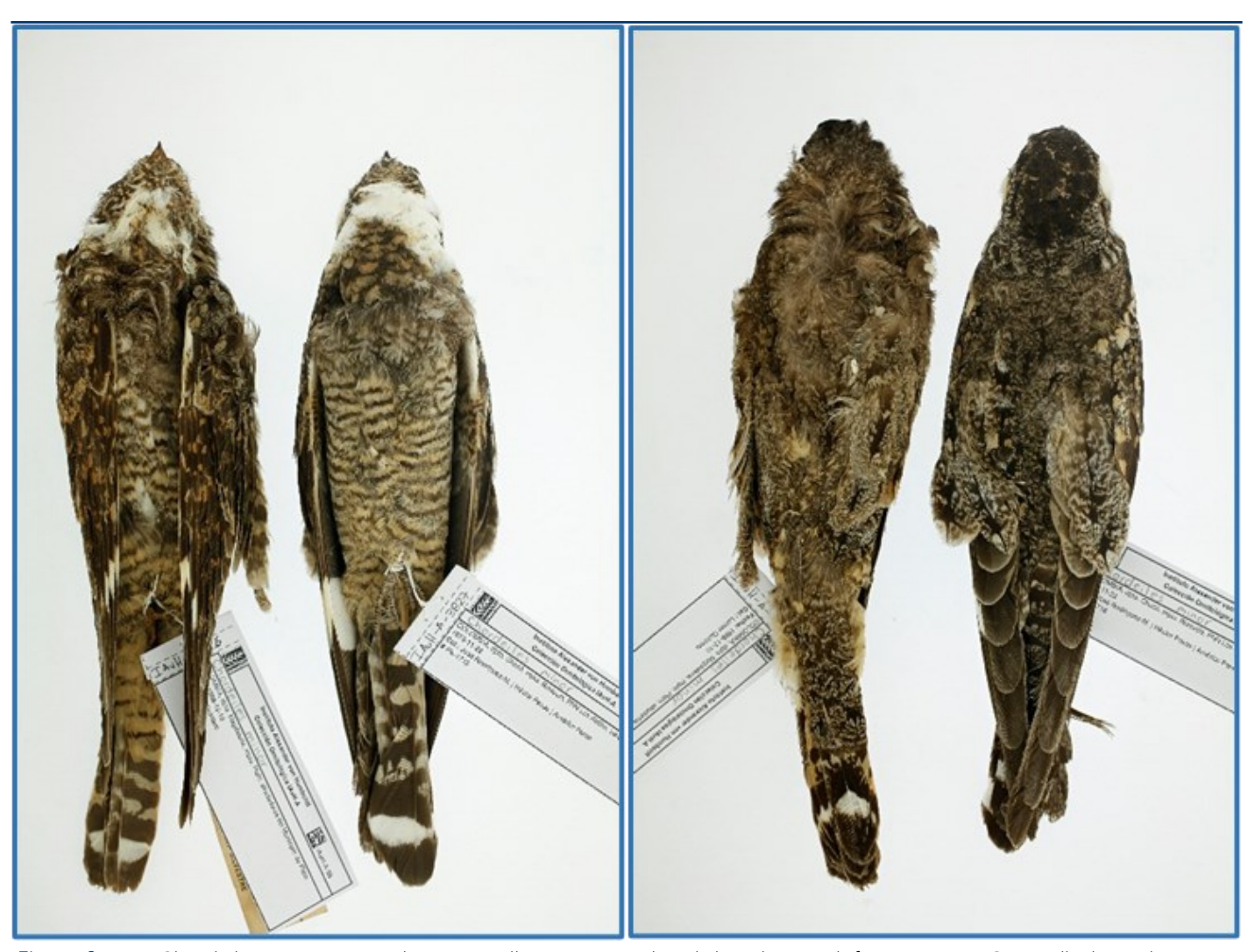
Figure 2. Two Chordeiles specimens in the IAvH collection, ventral and dorsal views: left IAvH-A 96, C. gundlachii ; right, IAvH-A 3867, C. minor for comparison; again, note the more buffy tones below of C. gundlachii .

each, the velocity over ten-day intervals was relatively constant, indicating at most brief stopovers in route. The wintering area of these birds was ca. 700 km east of that of the C. gundlachii tracked by Perlut and Levesque. Most striking was the difference in fall migrations: that of qundlachii involved an initial move northward to the Greater Antilles, then a lengthy stopover and after flying southeast, an apparent false start northward followed by an about-face to continue directly south to its winter home. Could this apparent confusion result from the breeding area of this bird being a recent displacement of at least 300 km southeast of the historical breeding range of its population (depending upon which island was inhabited by its source population)? What