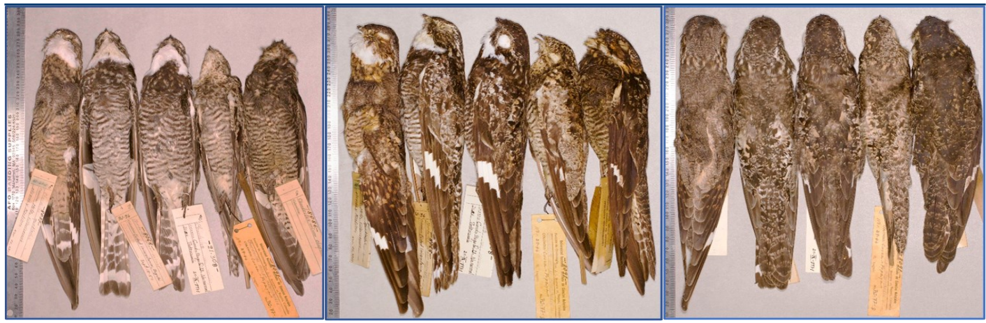
Figure 1. Chordeiles specimens in the ICN collection: ventral, lateral and dorsal views. Taxa, from left to right: ICN 8051, C. gundlachii ; ICN 8068, 21308: two C. m. minor , illustrating intraspecific variation; ICN 8091, C. m. aserriensis ; and ICN 8086, C. m. chapmani (the latter two being the two small races of C. minor ). Note the overall more buffy to brownish coloration of gundlachii , with underparts narrowly barred with brown and the buffy ground color extending to the tail coverts which are white in all races of minor ). All races of minor shown are more gray to blackish above, especially chapmani , which is more heavily barred below; aserriensis is notably pale, especially below. Also note that the specimen of gundlachii was prepared with the wings pulled down rather than folded in the natural position (note the displacement of the white tuft near the carpal joint and the white bar of the primaries compared to the specimens of minor ), and that this displacement makes the specimen appear considerably larger, and thus more easily confused with minor .

extending to the abdomen and undertail coverts, again consistent for gundlachii . The breast of the IAvH-A specimen was more whitish, passing to paler buff on the abdomen and undertail coverts (Fig. 2). This difference might indicate that they pertain to different subspecies (see Oberholser 1914), although comparisons with series of both would be necessary to confirm this. In both, the dark barring below was more fuscous, unlike the sharp black of barring in minor and the upperparts were paler, less black than those of minor (Figs. 1, 2). However, we did not detect the ruddier tones of any described subspecies of minor or gundlachii in our specimens, suggesting that postmortem fading of these tones might be widespread in our collections of both species, hence we hesitate to ascribe subspecies to our specimens of qundlachii .